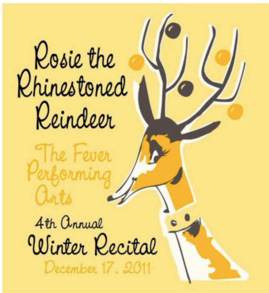
The original poster from the 2011 Christmas Show.

My mother always wanted to see some of my scripts turned into children's books. In October of 2020, she passed after a long and hard battle with cancer. In case you needed further confirmation, 2020 was the worst year ever.