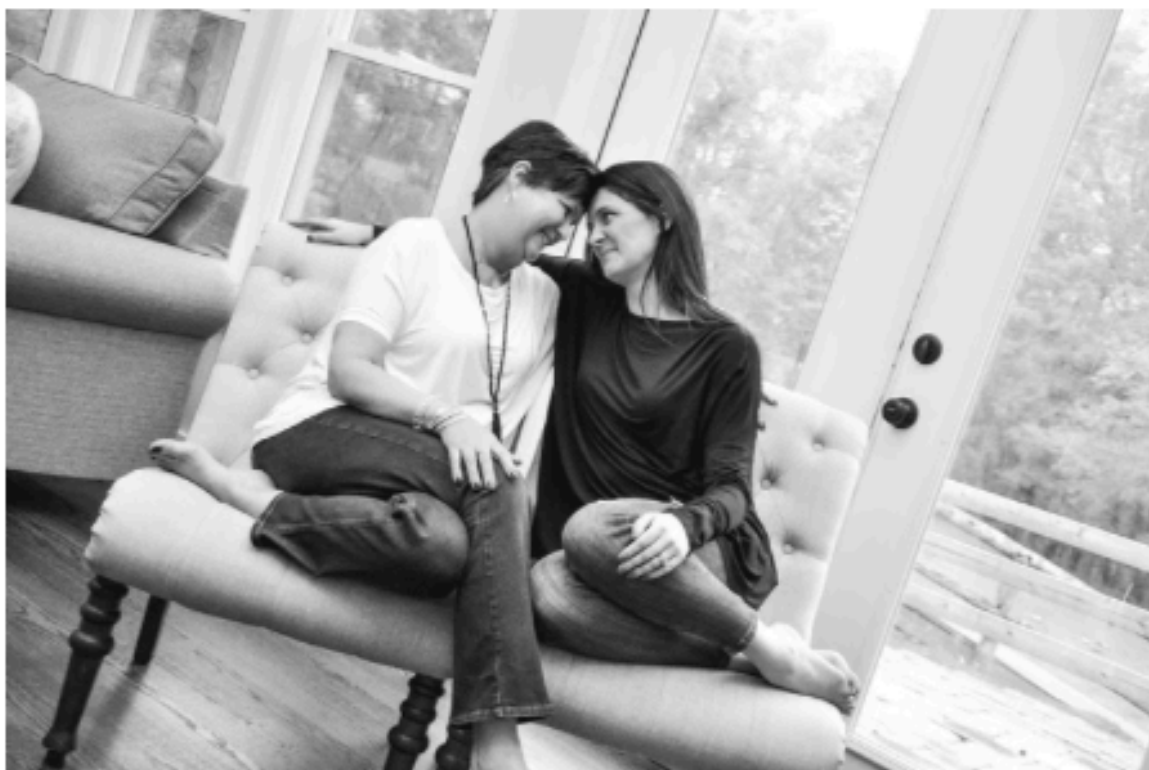
Even though I have plans to make Rosie the Reindeer a book series, this first book is dedicated to my mom.

My mom always claimed that the show "Rosie the Rhinestone Reindeer" was dedicated to my guilt of breaking her favorite Christmas ornament. While the guilt part may be a stretch, she had one thing right, she did spark an idea that has blossomed from stage show to now, children's book.