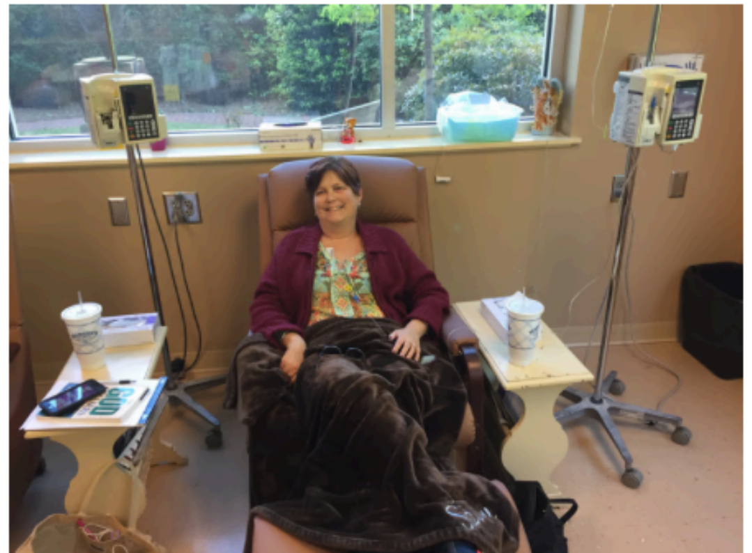
My mom passed at age 56. She battled multiple types of cancer and an autoimmune disease called Addisons. My mother had been sick since I was 14 years old.

My mom always claimed that the show "Rosie the Rhinestone Reindeer" was dedicated to my guilt of breaking her favorite Christmas ornament. While the guilt part may be a stretch, she had one thing right, she did spark an idea that has blossomed from stage show to now, children's book.