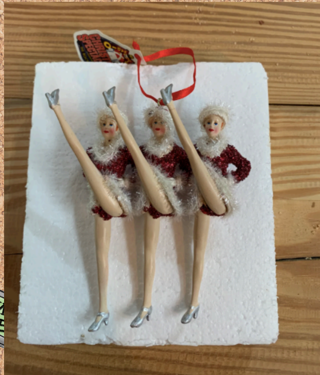
My mother's Radio City Rockette Ornament.... All Fixed.